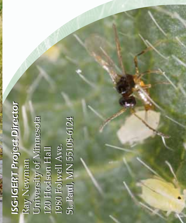
The parasitoid Binodoxys communis attacking the Asian soybean aphid. The University is an equal opportunity educator and employer. This material is available in alternative formats upon request: isgigert@umn.edu.